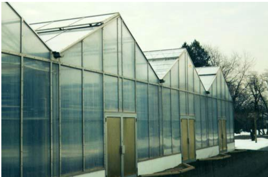
Figure 5. Surface Water Drained Off Greenhouse Roofs Has Been Collected Into Eavestroughs, So It Must Be Taken To A Sufficient Outlet.

Again, the water collected off a roof in an eavestrough ( Figure 5 ) is considered to be surface water, and it has no right of drainage. It must be taken to a sufficient outlet. Since this water has been collected, the greenhouse owner could be liable for the damage that this water causes on the downstream land. Other examples of collecting water include: private ditches that are not natural watercourses, swimming pool water, road ditches, irrigation water, water collected in catch basins, or runoff from parking lots and yard areas. The same answer applies as previously indicated.