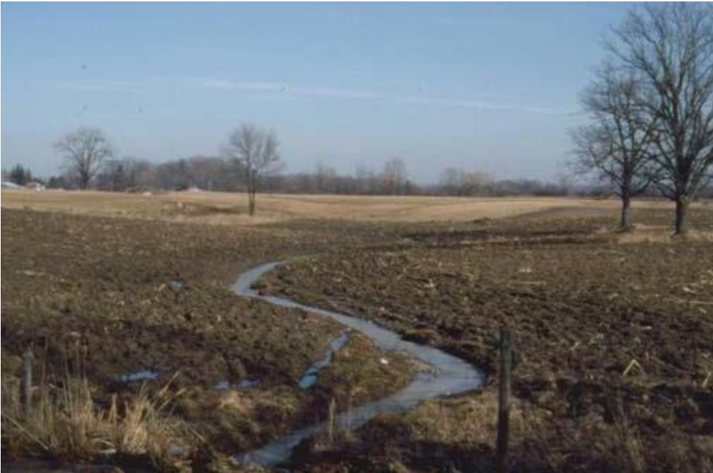
Figure 3. A private ditch or channel across a low area is not usually considered to be a natural watercourse.