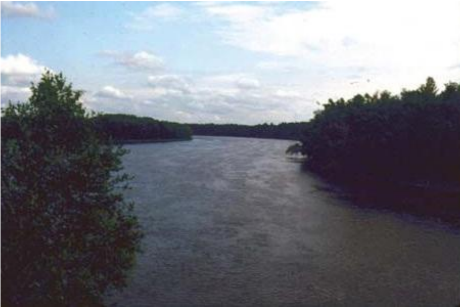
Figure 1. A natural watercourse with a defined bed, banks and sufficient flow.