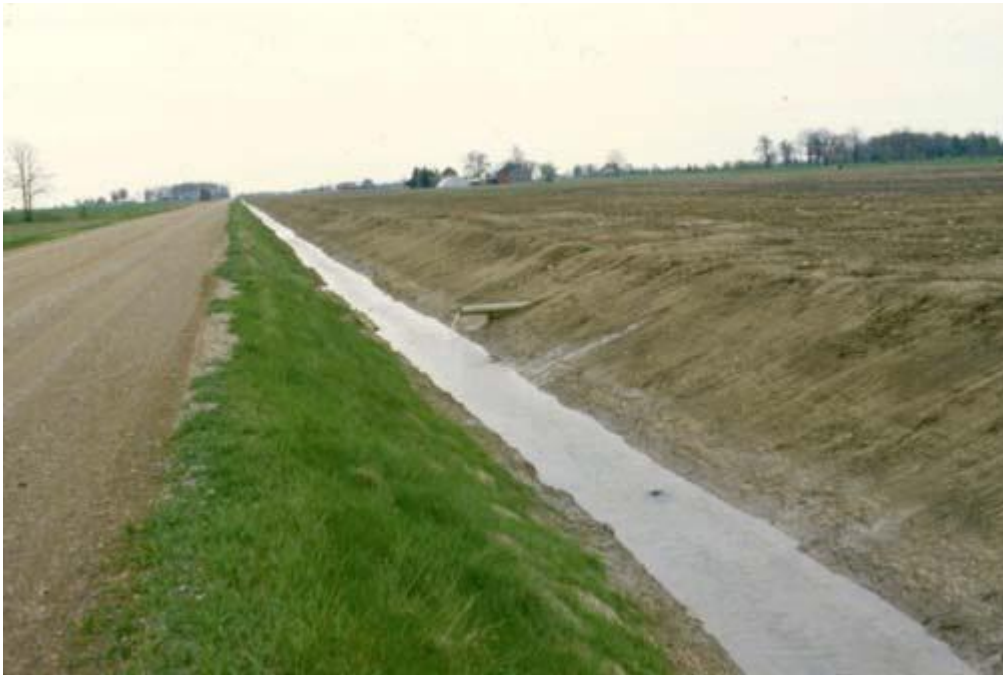
Figure 6. Municipalities are not obliged to dig their road ditches deep enough to outlet tile drains, although these ditches often provide excellent outlets. Permission from the municipality is required.

The road department is not required to dig their ditches deep enough to provide outlet for tile drains. See Figure 6 . Road ditches are just another form of private ditch, and the road authorities are only obligated to dig their ditches deep enough to handle the surface water off their own roads. They are not even required to take surface water from surrounding land. There is no right of drainage of surface water even if it is in a road ditch, unless the ditch is part of a Municipal Drain and access for tile drains is permitted. That is, an owner of lower land can block the passage of ditches that are not natural watercourses or part of a Municipal Drain. For normal road ditches, permission must be obtained from the road department to outlet tile drains into them.